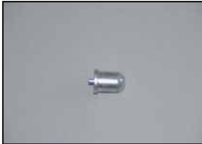
Convenience Light Switch

The following pictures denote some uses of mercury in auto parts.