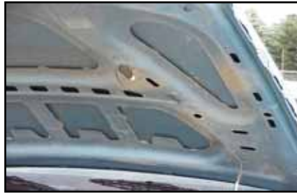
Placement of light switch in hood.