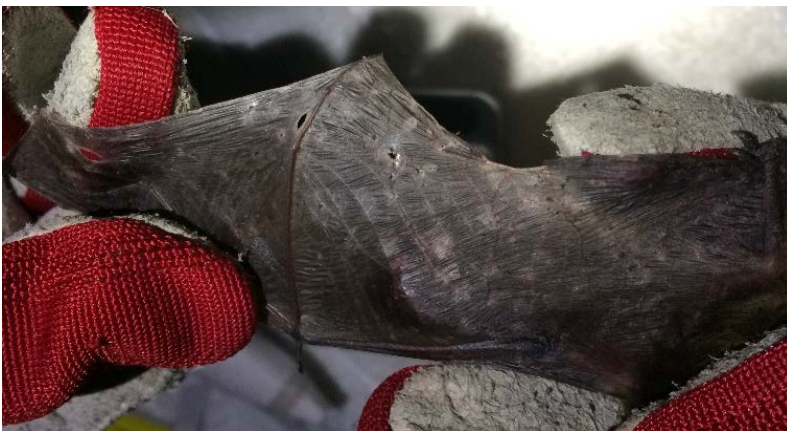
Figure 4- Wing membrane of a little brown bat showing damage caused by WNS

Despite the devastating mortality due to WNS, some bats are surviving, even with repeated exposures in WNS-contaminated sites. There is much ongoing, innovative research focused on treatment and controlling the spread of WNS. To ensure that populations have the best chance to recover, we need to protect habitats that are important to bats, including hibernation sites, maternity roosts, and forested habitats. As bat populations recover, they will need places to hibernate, feed, and raise their young.