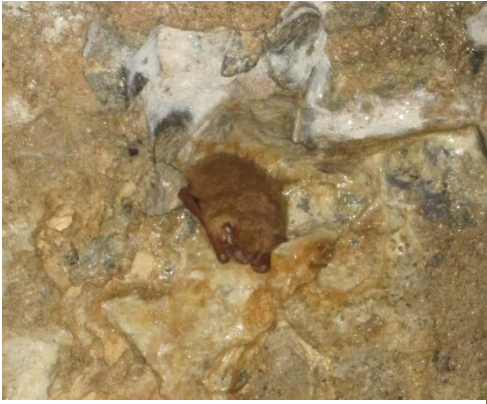
Figure 2- Tricolored bat hibernating in Rhode Island

accepted that the fungus was introduced into North America from Europe, where it has been found to occur. European bat species do not exhibit the same fatal response to exposure, suggesting that bats in Europe and Asia coevolved with the fungus. Given that bats do not migrate across the Atlantic Ocean, it is believed that Pd was somehow transported across the Atlantic by humans. Fungal spores can be spread by humans on clothing, footwear, and equipment. The discovery of an infected little brown bat ( Myotis lucifugus ) in Washington state in 2016, approximately 1,300 miles from the westernmost known infected site, likely resulted from the transport of the fungus or spores on something other than a bat.