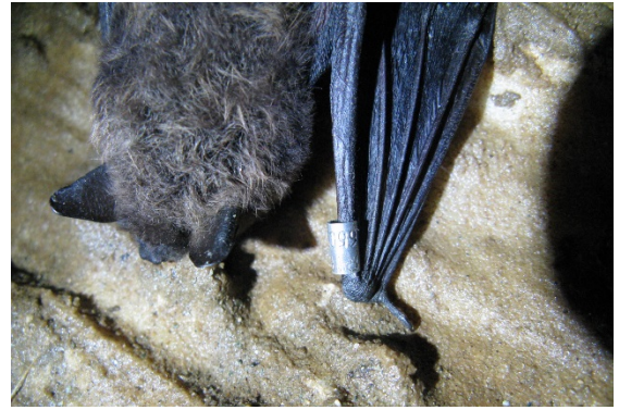
Figure 3- Little brown bat with RI DFW band hibernating in Vermont

geographic area, many more bats will likely succumb to the disease. Given their low reproductive rate (most cave bat species only produce one “pup” a year) and the normally high rate of mortality of young bats, it will likely be many decades or more before some bat species populations recover to levels that existed prior to the introduction of WNS.