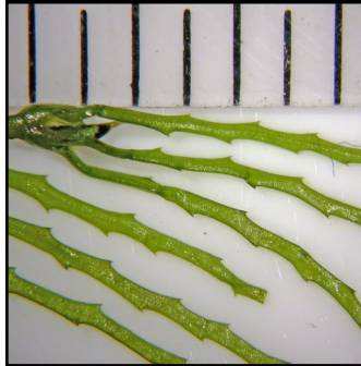
Leaves are serrated (dashes indicate \frac{1}{16} inch lines on a ruler)