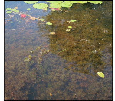
Spiny naiad plants carpet the bottom of a lake