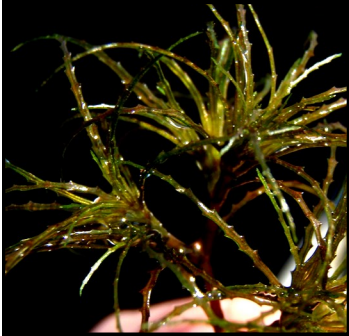
Spiny naiad leaves form “tufts” at the growing tip