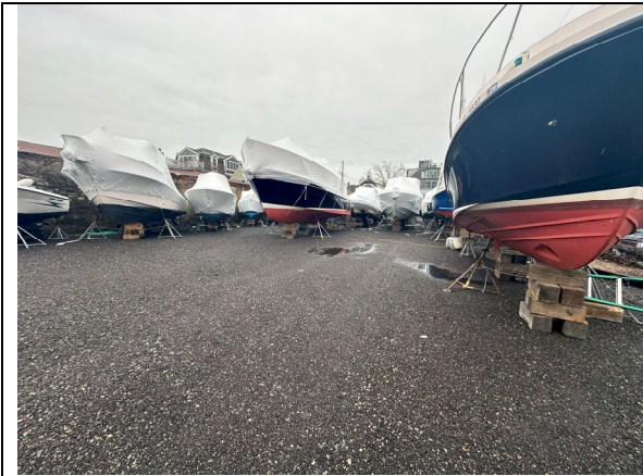
View of temporary cap area.