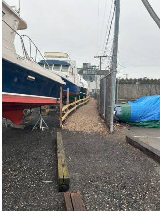
View of temporary cap area.

If you have any questions or concerns, please contact the undersigned at 401-723-9900.