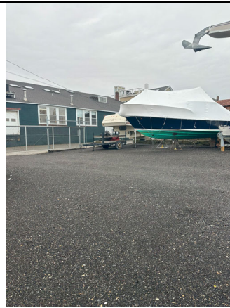
View of temporary cap area.