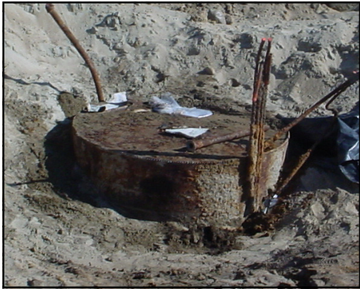
(Above) — One of two Springfield gas machine generators unearthed during the redevelopment of the Ocean House.

According to Dr. Linebaugh, four Watch Hill hotels boasted Springfield gas machines. Of these, only the Ocean House still stands. As to the fates of the other gas machines? That's a mystery that likely will remain buried in the past.