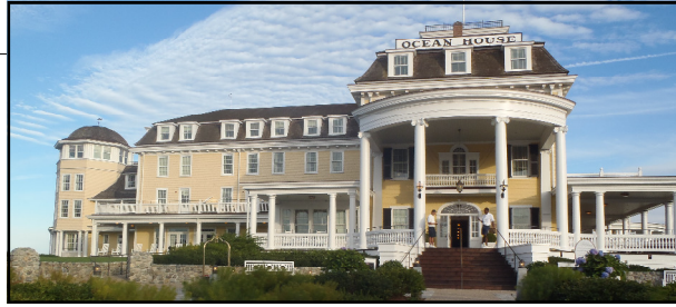
The Ocean House in Westerly

It's not often that a couple of underground storage tanks spark archaeological interest. But that's exactly what happened when contractors in 2007 unearthed two unusual tanks during the redevelopment of the Ocean House resort, located in the Village of Watch Hill in Westerly.