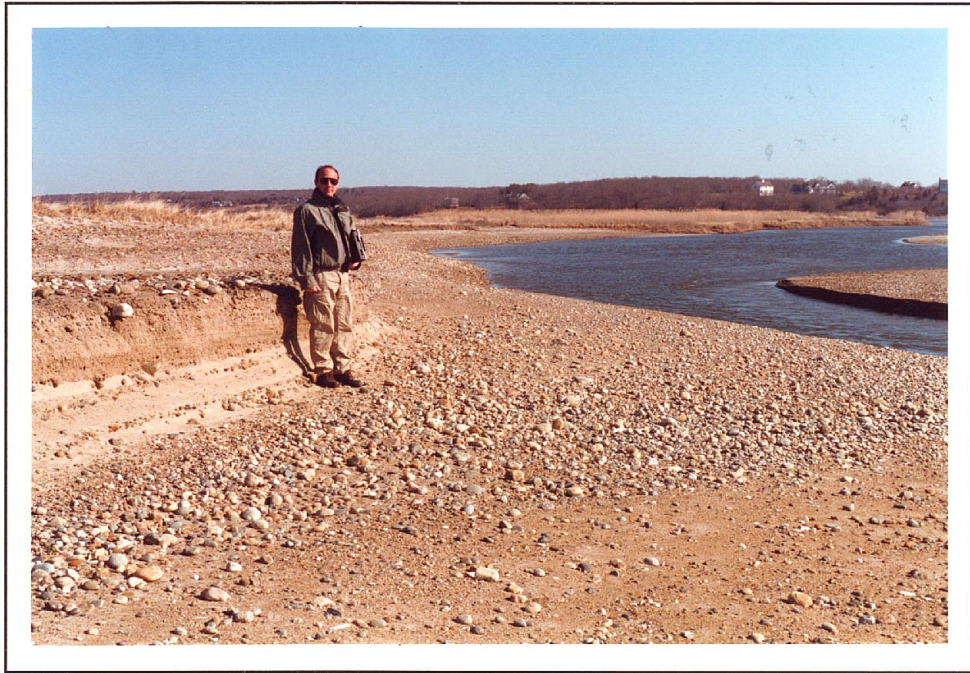
Looking NE at channel and scarp at low tide on 23 March 1999, Quicksand Pond (#13).