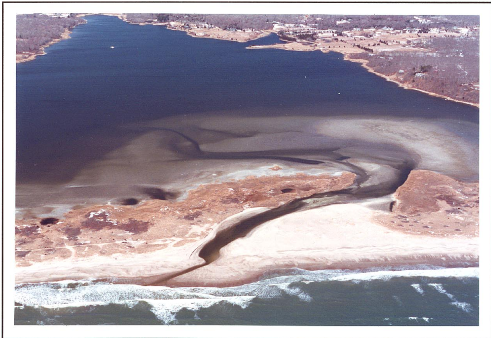
Looking north at low tide on 17 March 1999, Quicksand Pond (#13).