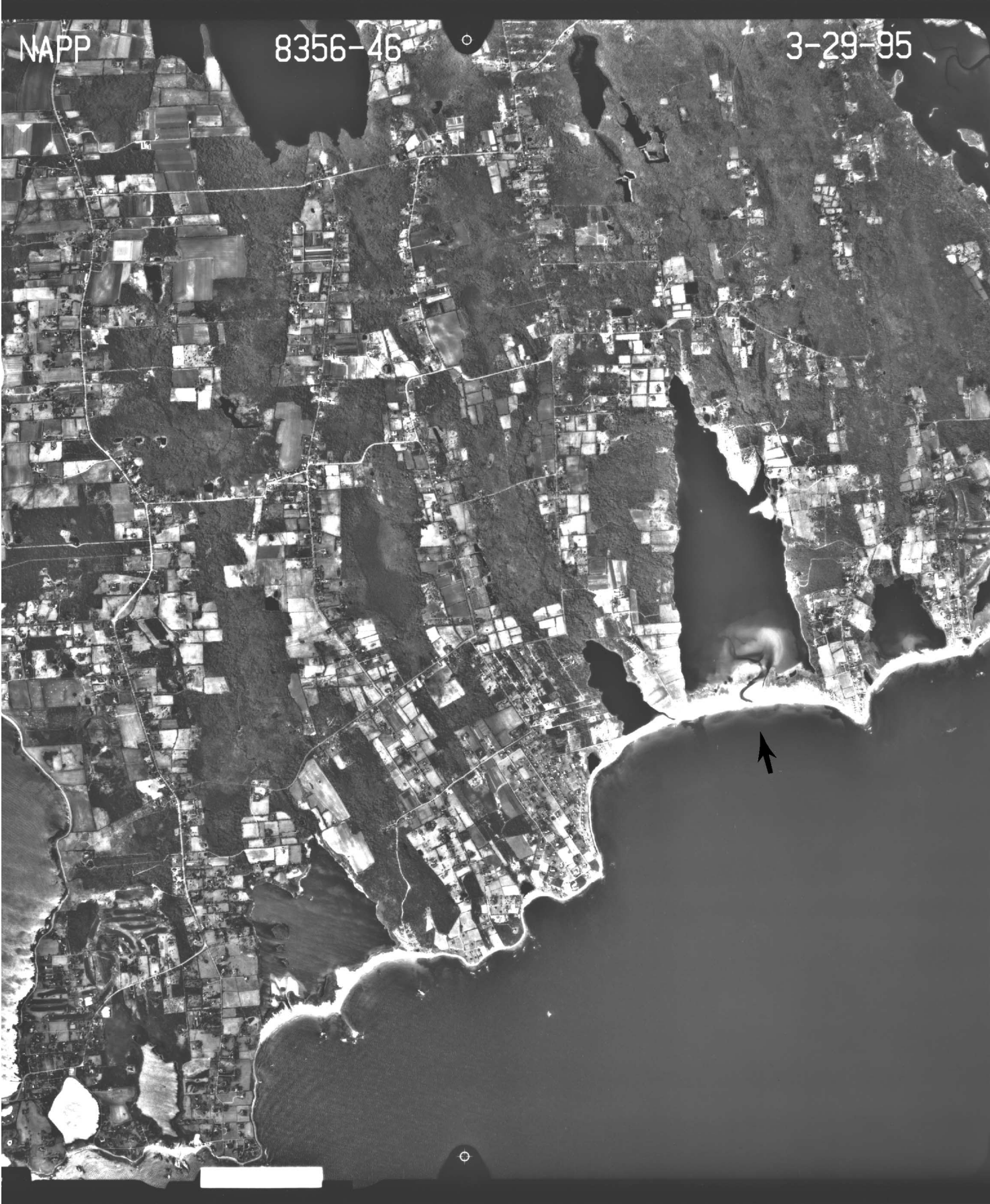
From USGS NAPP: roll #8356, frame #46; March 1995; scale -1:40,000